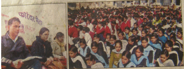
करियर काउंसिलिंग की जानकारी देते सदस्य व उपस्थिति लोग।