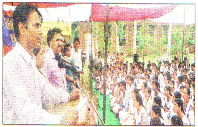
मेले में कैरियर के बारे में जानकारी देते शिक्षाविद।